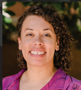
Mercedes Burns Biological Sciences