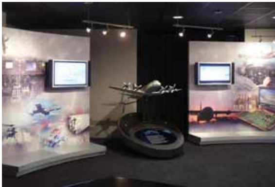
Tactical Solutions Center