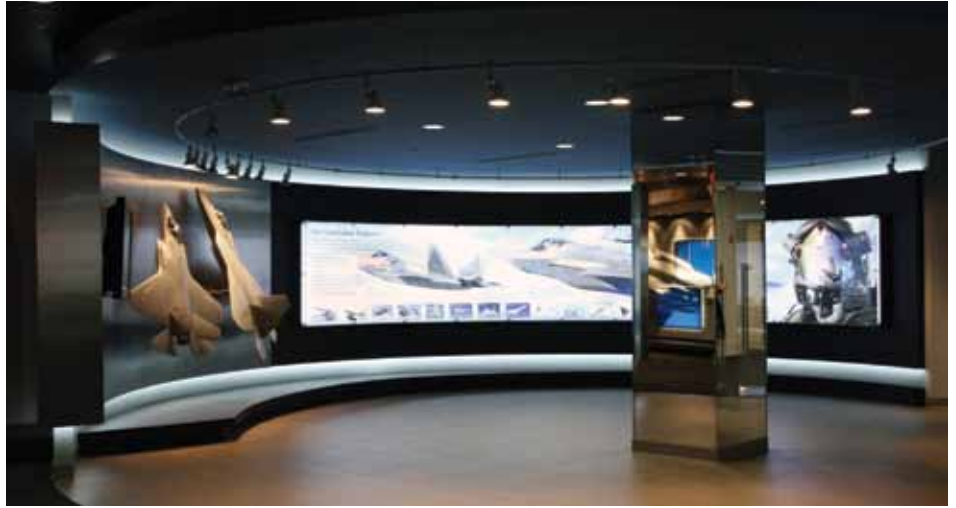
Fighter Demonstration Center

Industry partners Northrop Grumman and Pratt & Whitney have offices onsite to easily provide more in-depth explanations of the advanced systems they produce for both programs. Visits to the FDC should be coordinated in advance through your Lockheed Martin point of contact. Questions can be directed to: (703) 413-5800.