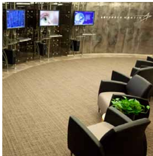
NexGen i3 Center