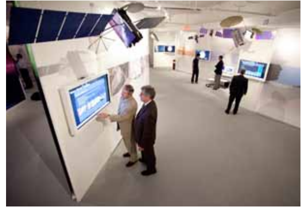
Space Experience Center

In the Space Experience Center (SEC) , visitors explore the critical role space plays in their everyday lives and understand the scope of Lockheed Martin's heritage in helping our customers apply advanced space and missile technology to connect, protect and explore. Multimedia displays and interactive demonstrations showcase the critical function of space utilization for both civil and military applications in space science and exploration, national defense and global security missions. A multipurpose theater features high-definition video presentations and demonstrations on specific space-technology and program topics. Unique interactive displays, such as the Orion Multipurpose Crew Vehicle cockpit simulator, a missile defense simulator, and the GPS Value Station provide visitors with a visceral experience of actual space technology in action. Direct your questions or tour requests to the SEC at: (703) 413-5932.