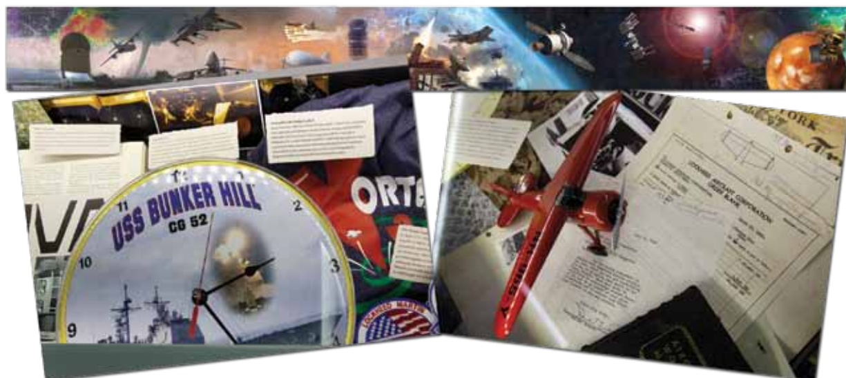
Images from the Legacy Experience Area

Lockheed Martin's venture across air, sea and space is shown through historical artifacts such as mission patches, blueprints and sketches, and archival magazines and newspapers. Stunning murals and interactive displays enhance the experience.