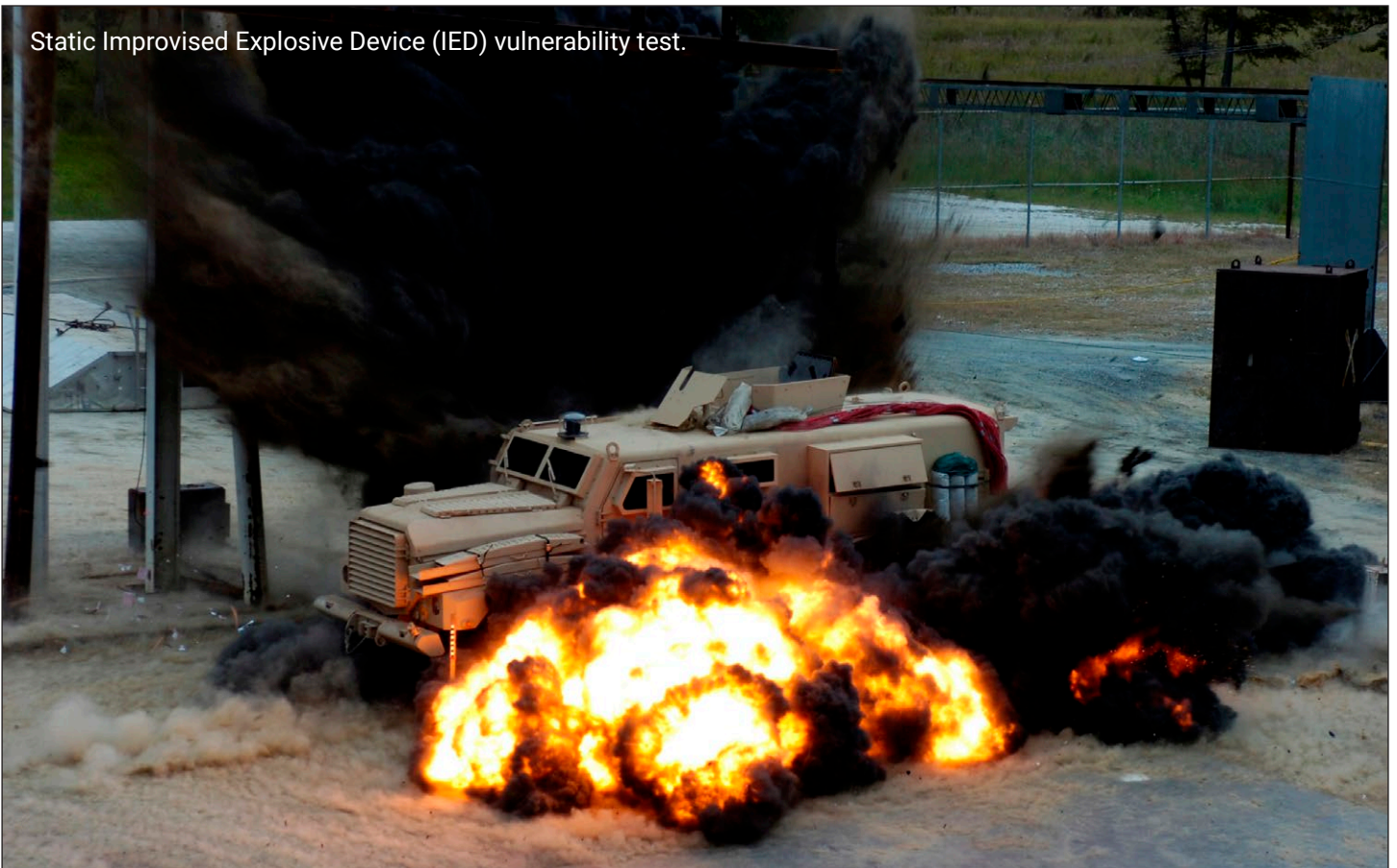
Static Improvised Explosive Device (IED) vulnerability test.