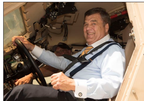
MD Congressman Charles "Dutch" Ruppersberger