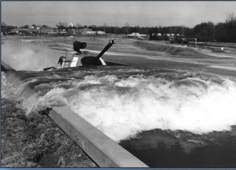
An M48 traverses the Munson Test Area Shallow Water Fording Basin, circa WWII.