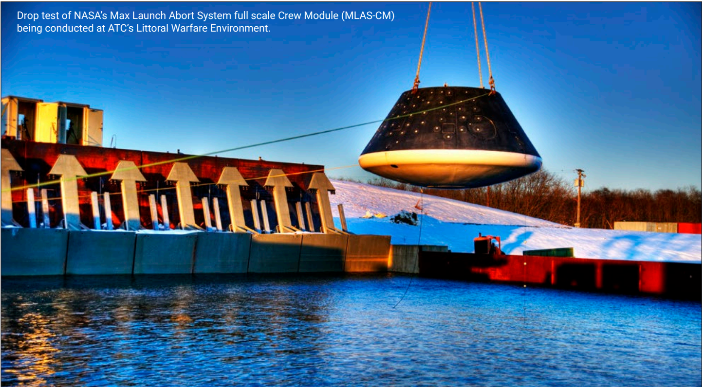
Drop test of NASA's Max Launch Abort System full scale Crew Module (MLAS-CM) being conducted at ATC's Littoral Warfare Environment.