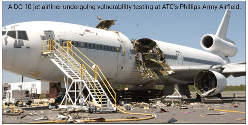
A DC-10 jet airliner undergoing vulnerability testing at ATC's Phillips Army Airfield.