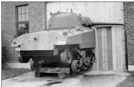
Power train efficiency test being performed on an M43 medium tank, September 1943.

During World War II every type of weapon, from a pistol to a 16-inch gun, and numerous variants of tank, tractor and jeep, were tested, fired and driven at APG. The hours were grueling as personnel labored on tests at all hours, day and night. Between 200 and 350 test projects usually occurred at once, and from five to a dozen directives for new projects were received weekly. There were two basic types of testing: experimental and acceptance. Experimental testing was applied to newly designed weapons to test all competencies. Acceptance testing was conducted on standard weapons to ensure they operated properly. Noteworthy results include the standardization of many rocket items, bazooka (the only completely