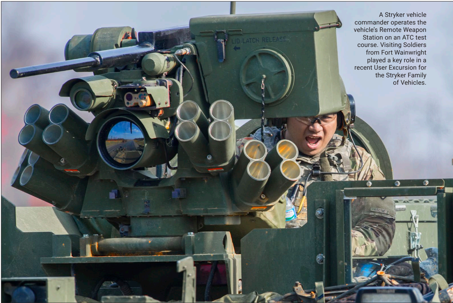
A Stryker vehicle commander operates the vehicle's Remote Weapon Station on an ATC test course. Visiting Soldiers from Fort Wainwright played a key role in a recent User Excursion for the Stryker Family of Vehicles.