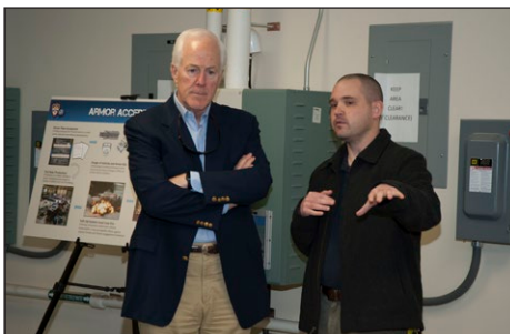
Texas Senator John Cornyn