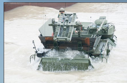
Image sequence of an Assault Amphibious Vehicle (AAV) undergoing a stabilization test in the Littoral Warfare Environment wave pond.