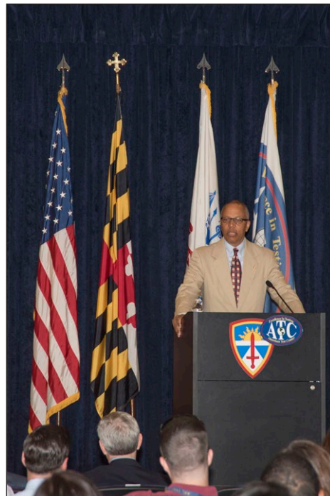
MD Lieutenant Governor Boyd Rutherford