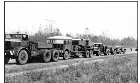
A 25-ton 6 x 6 truck tractor undergoes a field dynamometer test, November 1947.

In October 1946, a 100-ton T28 super-heavy tank armed with a 105-mm gun was unveiled to the public, as well as a fully automated Garand rifle, a 75-mm recoilless rifle fired from the shoulder, and a 75-mm and 105-mm recoilless