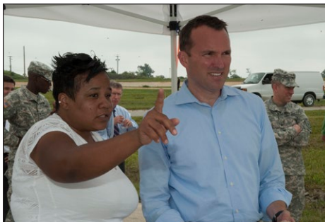
Secretary of the Army Eric Fanning

ATC is the U.S. Army Test and Evaluation Command's (ATEC) testing showcase.