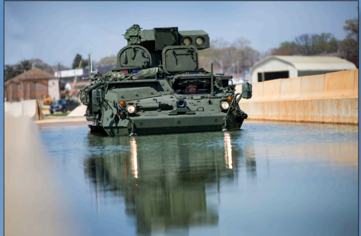
A contemporary image of a Stryker MGS negotiating the Fording Basin.