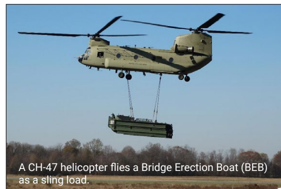
A CH-47 helicopter flies a Bridge Erection Boat (BEB) as a sling load.