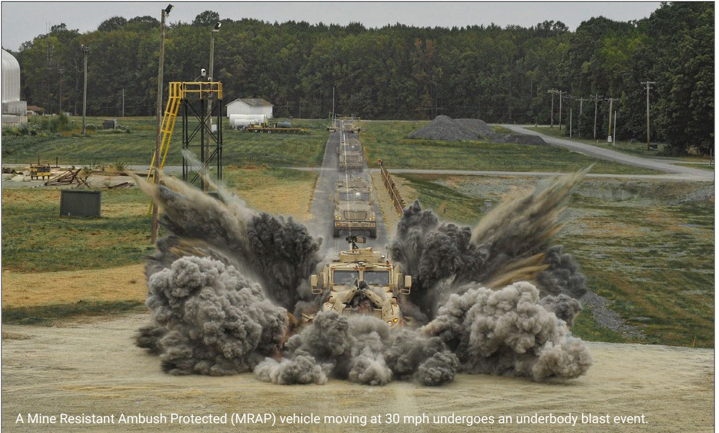
A Mine Resistant Ambush Protected (MRAP) vehicle moving at 30 mph undergoes an underbody blast event.