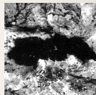
1964 Spy plane image