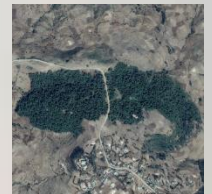
2014 Satellite image

Applications open December 1 st , 2015 Apply online at www.colby.edu/reu-in-ethiopia